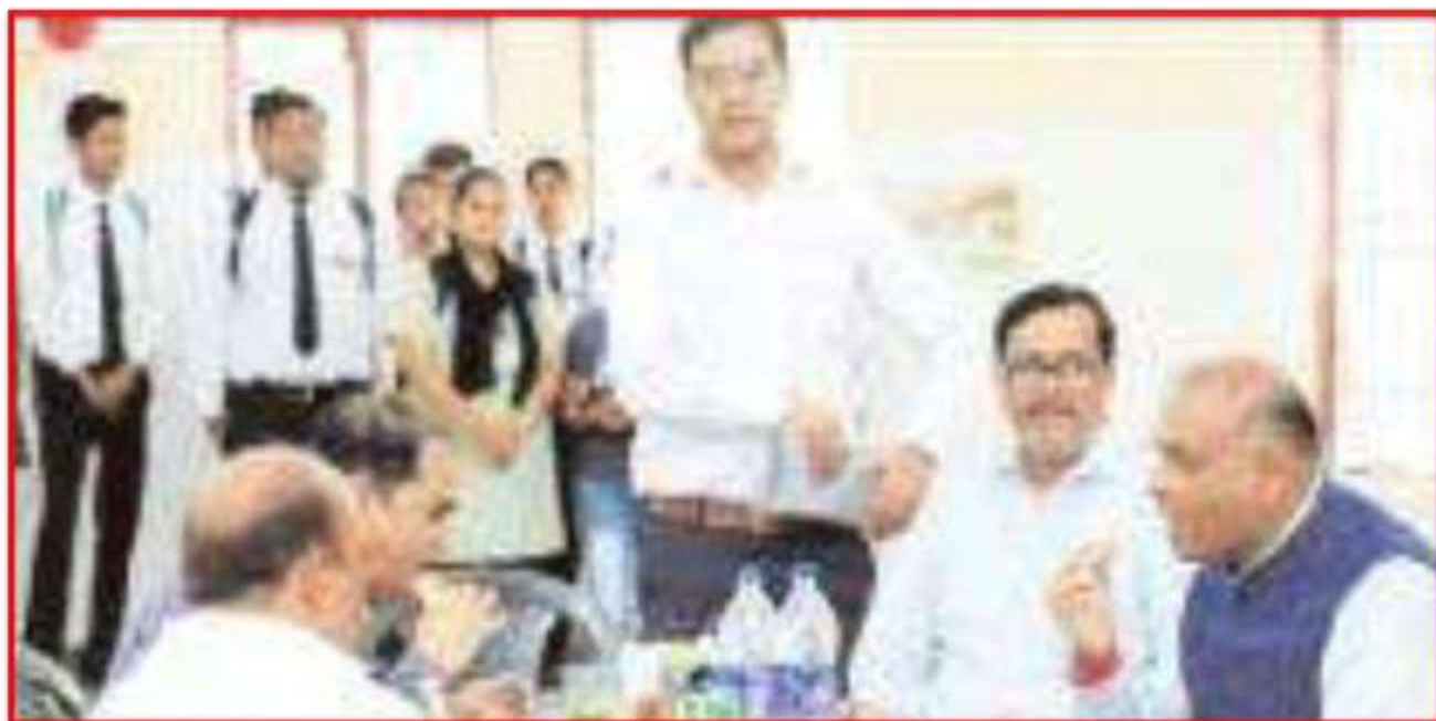
Three days Eye Test Camp

Details of the Program: The aim of this program is to provide maximum benefit to the general public from the activities of the university. In the same sequence, this "three-day free eye check-up camp" is being inaugurated. This camp will definitely benefit the general public living in the university campus as well as the surrounding rural areas.