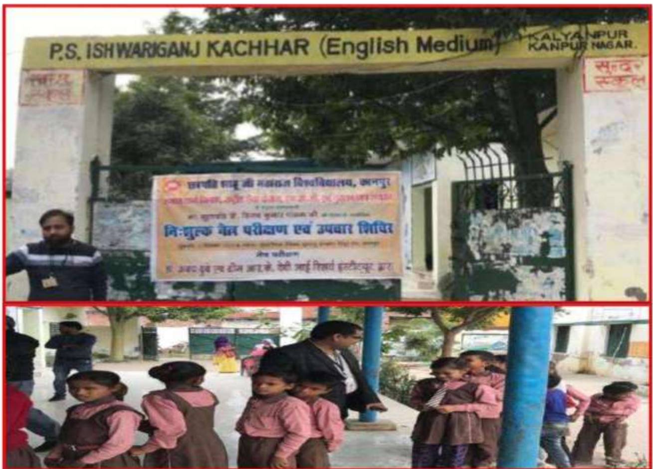
Eyes' Camp at Ishwariganj, Bithoor

Details of the Program: The Department of Social Work organized a Eyes' check-up camp with the support of NSS, NCC and University's Alumni Association in Ishwariganj Primary School and Village, Bithoor, Kanpur Nagar.