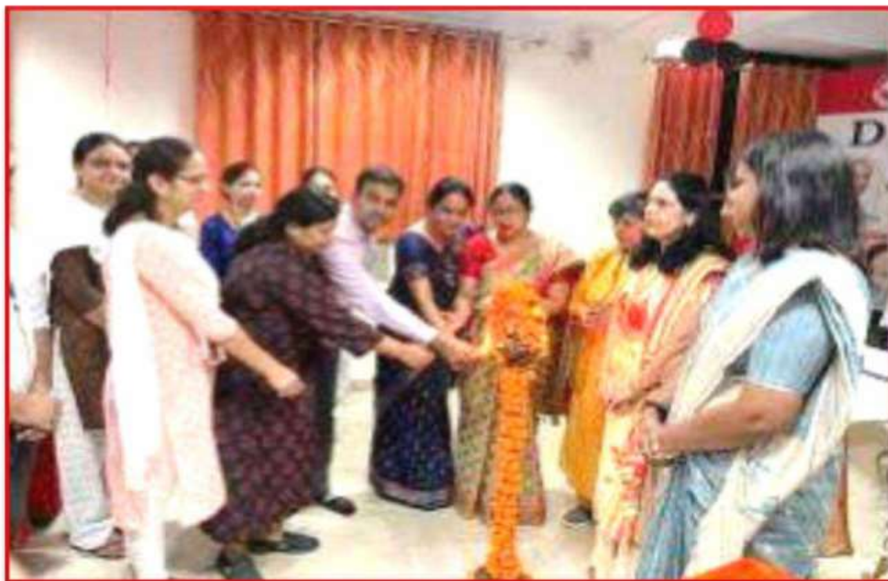
DHEERA- No violence against women