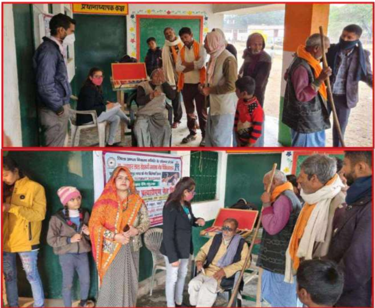
Eyes' Check-up Camp at primary School, Bidhnu Block

Details of the Program: The Department of Social Work and JL Rohatgi Eye Hospital Kanpur organized a Eyes' Check-up Camp at Primary School, Kadri, Bidhu Block Kanpur Nagar. In this camp, we found 15 cataract patients and 06 patients were immediately refer red to the hospital and they were successfully operated.