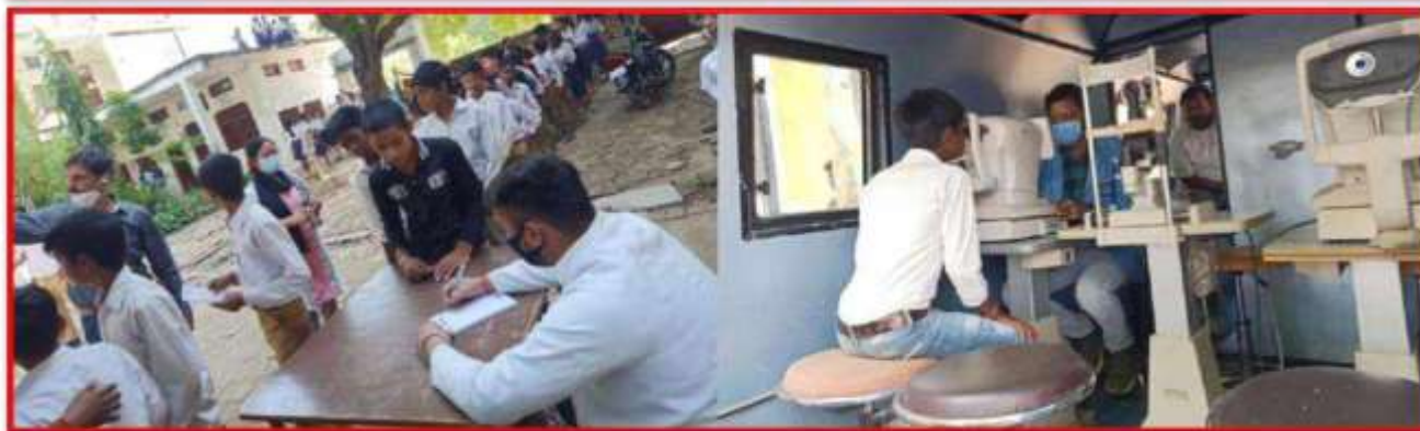
Health Camp at Baghpur Inter College