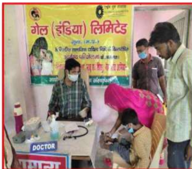
Health Camps in Madhya Pradesh