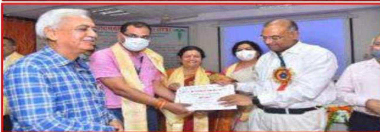
Doctor's Honor Program